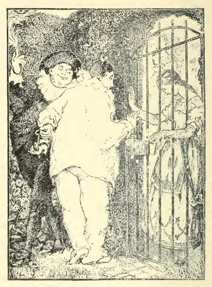
Prunella. It's the key of the garden gate. Pierrot. Is it really?